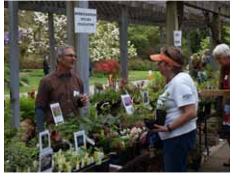
FlorAbundance Plant Sale at the Arboretum