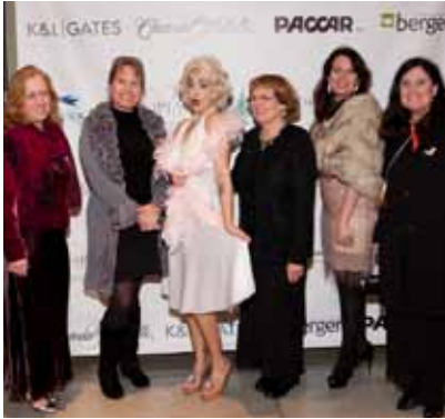
Opening Night at the Garden Show