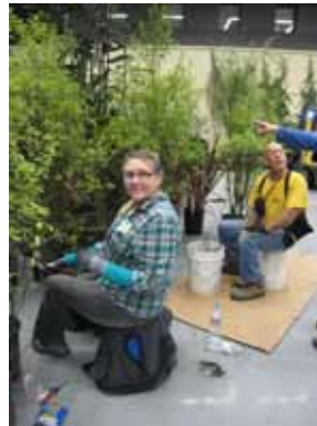
Building the 2013 Display Garden