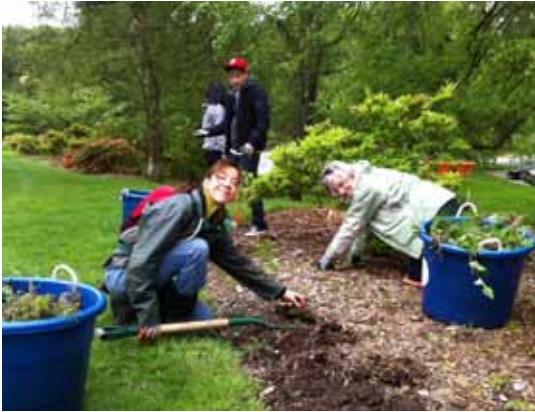
Garden Care: Volunteers from the new Azalea Way Stewards Program in May 2013.

Another way we helped sustain the Arboretum collections this past year is through our coordination of the Garden Stewards program. Since launching the Pacific Connections Garden Stewards program with UW Botanic Gardens in fall 2011, we have recruited 48 volunteers to help Arboretum horticulture staff care for the new exhibits in Pacific Connections. Inspired by this success, we launched a new stewards initiative in late summer 2012 with Seattle Parks and Recreation and UWBG to recruit volunteers to help maintain Azalea Way. As of June 2013, we have signed up 13 Azalea Way stewards, who help weed and mulch this historic component of the Arboretum from April through November.