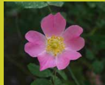
[Opposite Top] Witch-hazel blooming in the Winter Garden. [Opposite Bottom] Sorbus rehdiana in the Sorbus Collection. [Left] Cherry trees blooming on Azalea Way. [Top] Rosa marginata blooming on Crabapple Meadow.