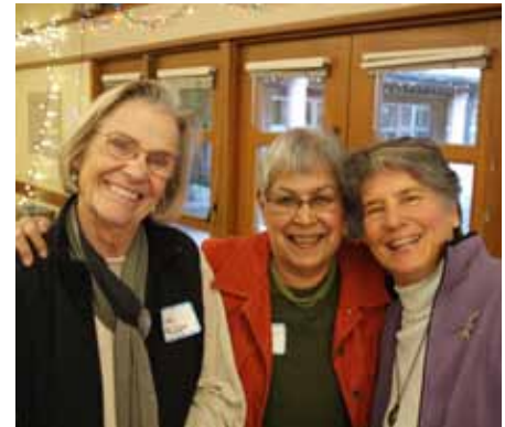
Volunteer Recognition Dinner