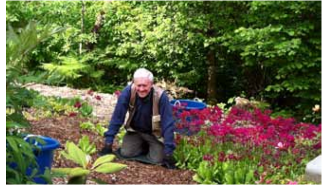
Pacific Connections Steward Weeding the China Entry Garden