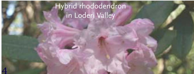
Hybrid rhododendron in Loderi Valley