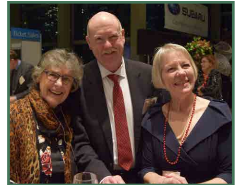
A Dazzling Opening Night Party