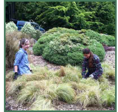
Weeding by Hand: Garden Stewards working in the New Zealand Forest.

In late August, 2014, the Foundation helped organize a day of service for the UW's Cross Country Team in the Arboretum. The team trains regularly in the park and was inspired by our GiveBIG yard sign campaign last year to "give back" and show its appreciation for this great venue for recreation. About 40 athletes worked on three mulching projects in the Pacific Connections Garden. The team also donated $2,500 to support future group service projects in the Arboretum.