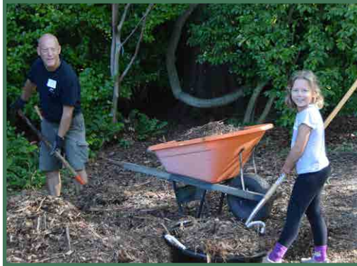
Kiwis Helping Out in the New Zealand Forest