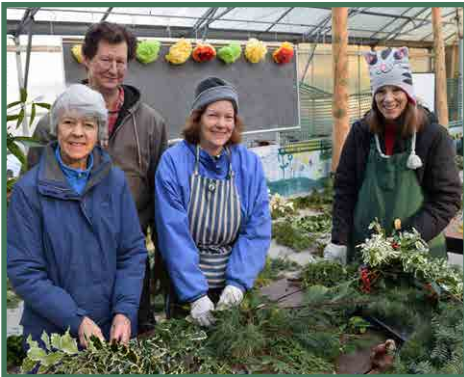
Volunteers Preparing for Gifts & Greens Galore