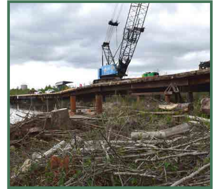
Heavy Duty: 520 bridge construction on Foster Island.

Construction of the Arboretum's new multi-use Loop Trail—which is being funded by WSDOT as part of mitigation for the effects of the 520 rebuild—was slightly delayed this year due to a permitting issue with the Army Corps of Engineers. Seattle Parks and Recreation expects to have full approval by July 2015. The two-year project will then be advertised for bidding, and if all goes well, construction will begin in August 2015.