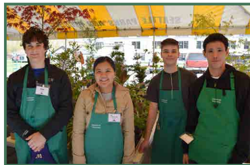
Helping with Smiles: High schoolers doing their volunteer service work at FlorAbundance.