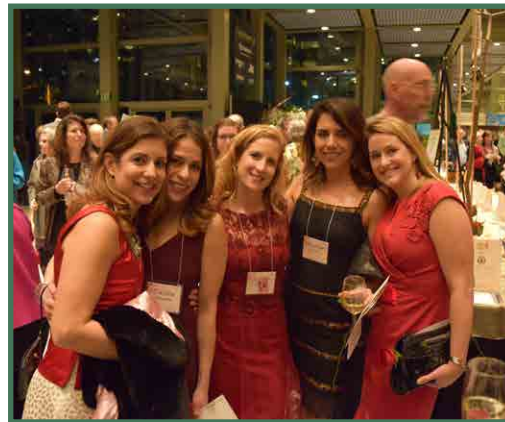
Happy Partygoers: Guests enjoying the wine reception at Opening Night.