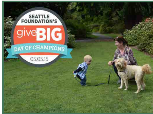
Another Successful GiveBIG Campaign