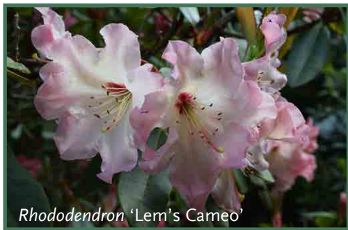
Rhododendron 'Lem's Cameo'