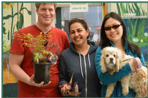
Satisfied Shoppers: Attendees at our Early Bloomers Plant Sale.

We began our 2015 spring event season with the Early Bloomers Plant Sale on April 11. Despite a poor weather forecast, the day turned out to be plant-sale perfect! And our amazing Greenhouse and Nursery volunteers helped raise over $5,000 for the Arboretum in under four hours. Our largest plant sale of the year, FlorAbundance—also the biggest sale in the region—returned to Magnuson Park on April 25 and 26. Dry weather and a beefed-up marketing campaign helped us increase attendance over last year’s event and raise key funds for the Arboretum.