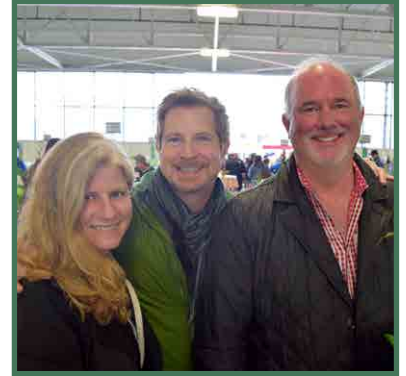
FlorAbundance Draws a Crowd