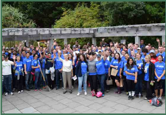
An Amazing Day of Caring