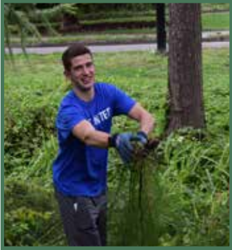
Wetland Warrior: A volunteer weeding Arboretum Creek during Day of Caring.

Volunteers are the life force of the Arboretum Foundation. Very little could be accomplished at the Arboretum without the hundreds of dedicated and passionate people who volunteer their time and energy. You'll find them in gift shop, providing services to visitors; in our Pat Calvert Greenhouse and Plant Donations Nursery, providing plants for the people of Seattle, as a fundraiser for the Arboretum; and out in Arboretum, tirelessly weeding the planting beds and helping keep this place looking beautiful. In the past 12 months, 800 volunteers have donated more than 14,000 hours to support the Arboretum.