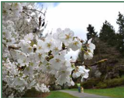
Flowering cherry on Azalea Way.