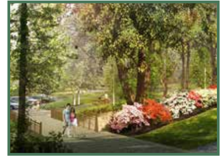
Boyer Bridge: One of three new bridges being built over Arboretum Creek as part of the new loop trail.

The trail was originally outlined in the Arboretum Master Plan, adopted in 2001 after extensive public input. It is being funded by mitigation from the SR 520 bridge rebuild. Construction of trail will continue through December 2017. Find out more at LoopTrail.seattle.gov .