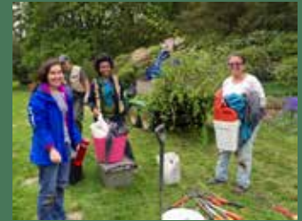
Happy Helpers: Garden Stewards cutting back forsythia on Azalea Way.

This year marks the fifth anniversary of the Garden Stewards Program, which continues to grow and yield great results. Throughout much of the year, you'll see the stewards out and about along Azalea Way, or tucked back into the gardens at Pacific Connections, with hori knives at the ready to rid our beautiful park of pesky weeds and invasive species. All in all this past year, 75 stewards volunteered over 900 hours of work. They held 69 weeding and mulching sessions—36 on Azalea Way, and 34 in the Pacific Connections Garden.