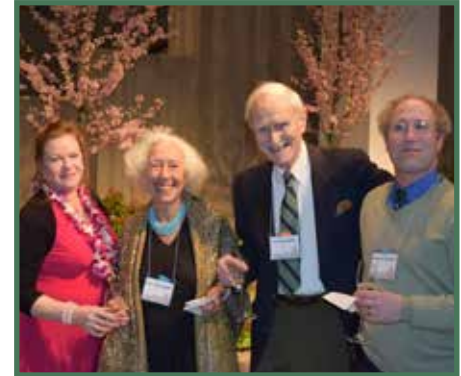
Champagne Toast at the Opening Night Party