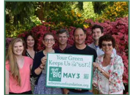
A Staff Photo During GiveBIG