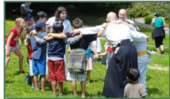
Children's Day Fun: Seattle Aikikai leading an Aikido demonstration at the Japanese Garden.

In 2014, Seattle Parks undertook a formal review of the Japanese Garden's management structure and found that its own management of the Garden was fragmented and that the Garden's support functions were badly divided—with no group having the capacity or expertise to provide the strong support the Garden needed. So, Seattle Parks asked that the support roles for the Japanese Garden once again be unified under the Foundation, as they were at the beginning.