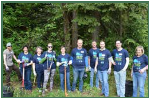
Weed Brigade: FSi Consulting Engineers removed invasive trees in the Pacific Connections Garden on Earth Day!

We had a wildly successful time at the NorthWest Flower & Garden Show in February, thanks in large part to our volunteers. Forty-nine volunteers helped build our multi-award-winning Display Garden, which captivated the patrons of the Garden Show with the beauty of the Hoh Rainforest (see page 14). Fifty additional volunteers worked as docents at the Garden during the week of the Show, encouraging passersby to come to the Arboretum and see its treasures. Forty volunteers made our Opening Night Party at the Garden Show our most successful fundraiser to date (see page 6). We could not have made such an impact without you!