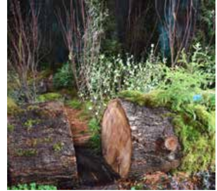
Garden Trail: Salvaged wood was staged to look like nurse logs and tree trunks to give authenticity to our forest garden.

“The Hoh: America’s Rain Forest” was designed to look like a diorama at a natural history museum. Painted backboards and other framing encapsulated the garden to create a window into Washington State’s ancient, temperate rain forest. Salvaged logs were staged to look like the trunks of giant trees. Mosses and ferns draped from the trees, and sword ferns, salal, mahonia, and other native groundcovers created a rich, textured understory. A misty rain added authenticity to the garden and helped create a suitable microclimate for the plants.