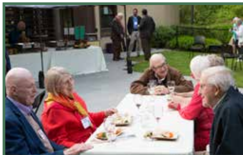
Arbor Circle members enjoying a reception at the Japanese Garden in May.