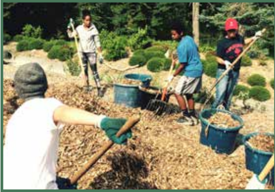
Middle Schoolers from Seattle Schools Mulching the New Zealand Forest