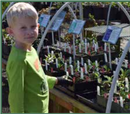
A Budding Gardener at the Early Bloomers Sale