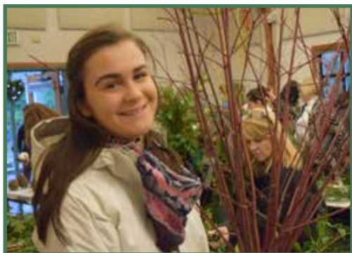
A young shopper browsing the selection of greens at Gifts and Greens Galore