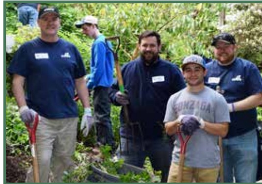
Earth Day Volunteers Weeding