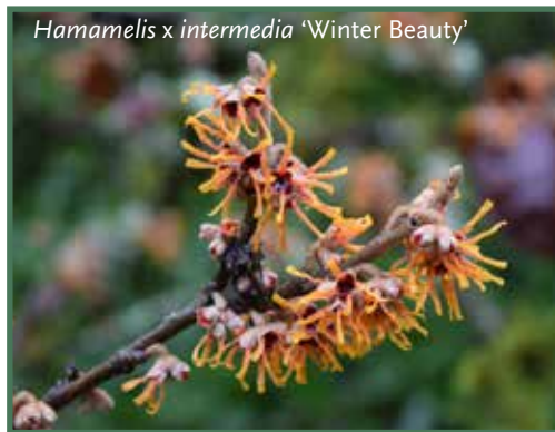
Hamamelis x intermedia 'Winter Beauty'