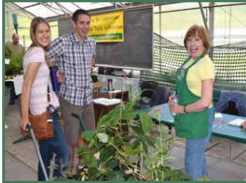
Check Out at the Fall Abundance Plant Sale